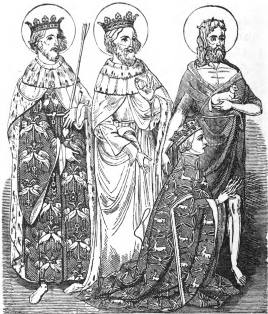
Richard II., with his three protectors, S. John the Baptist, S. Edmund, and S. Edward the Confessor. (From an ancient diptych now at Wilton.)